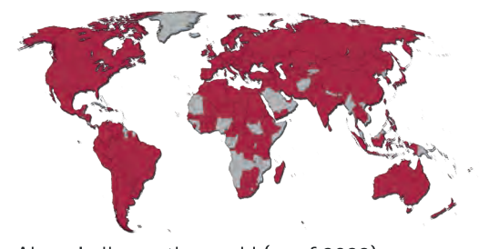
Alumni all over the world (as of 2023)

Graduates of the DA can be found in the public administration of their countries, EU institutions, international organisations, the private sector and serving as diplomats.